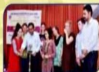
Meet with Foreign Students