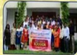
Study Tour to Kolkata