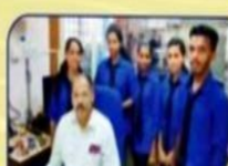
Interaction with the bank manager