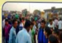
Visit to Malpe Port