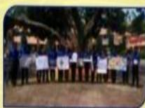
CIRCLE OF VOICE