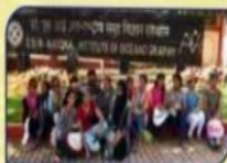
Study Tour To Goa