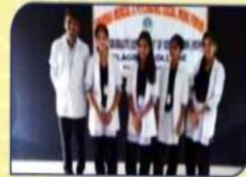
Medical and Psychiatric Students