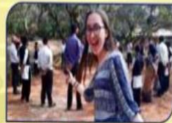
Day with German Students