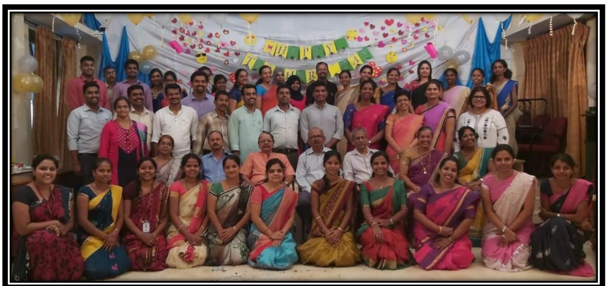
ALUMNI TEACHERS DAY CELEBRATIONS