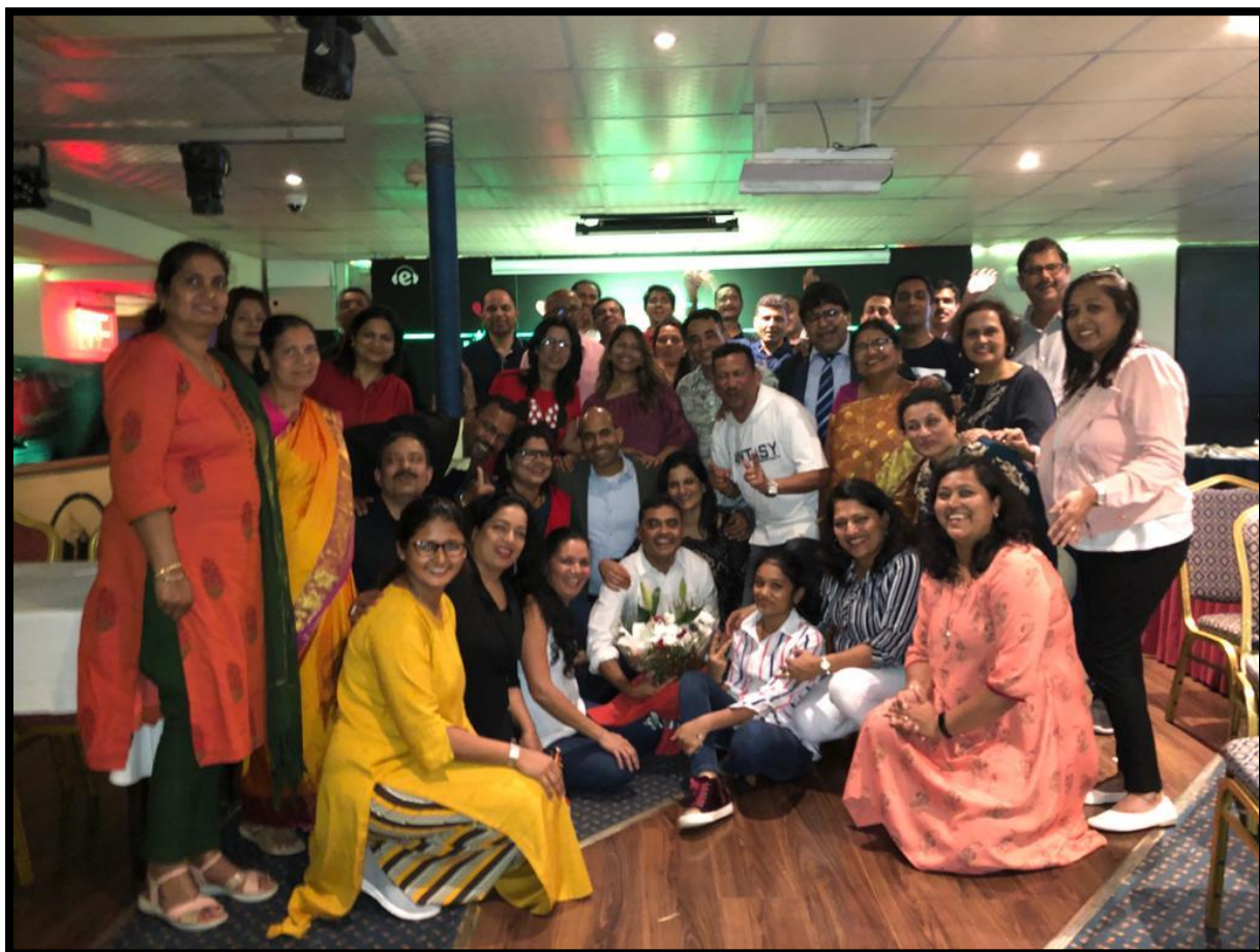
RE Union of Dubai Based Alumni

NRI ALUMNI FAMILY GATHERING IN DUBAI: On 21.02.2020 the Dubai based alumni organized a get together programme. A large number of former students attended the meet. Some of the officer bearers of the Alumni Association along with the principal attended the programme.