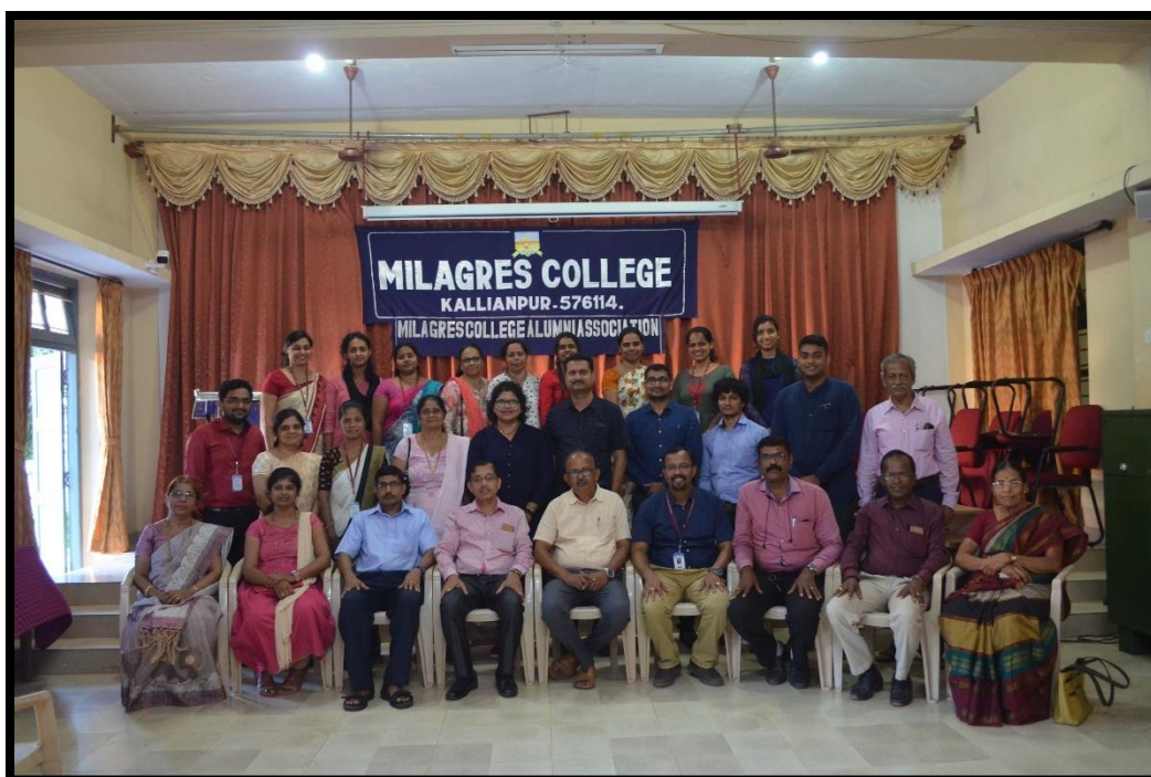
OFFICE BEARERS AND EXECUTIVE COMMITTEE MEMBERS OF ALUMNI ASSOCIATION