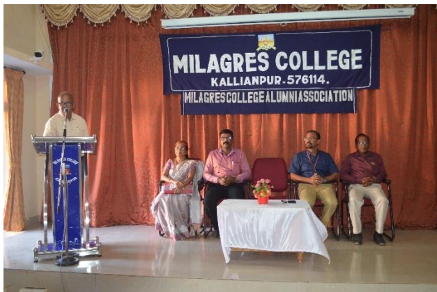
PRESIDENT WELCOME SPEECH-GENERAL BODY MEETING