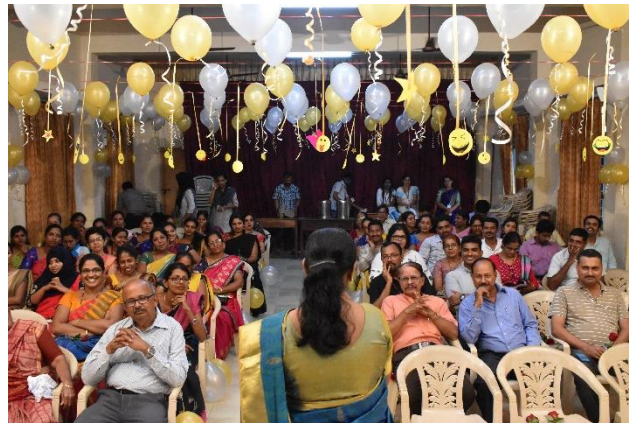
GUEST OF HONOUR ON TEACHERS DAY