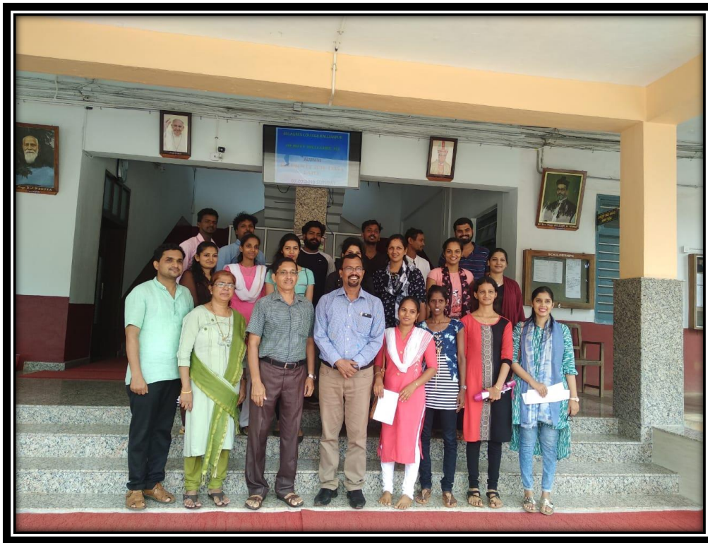
2012-2013 BA BATCH RE-UNION