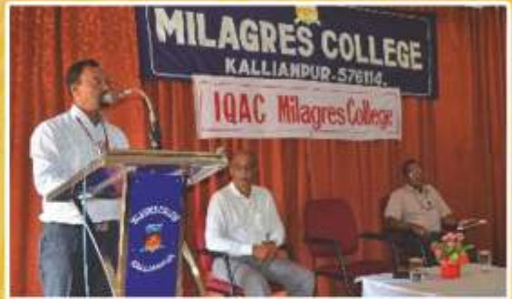
10 Days Faculty Development Programme