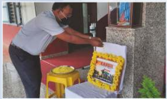
Kargil Vijay Diwas