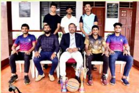
BASKET BALL TEAM