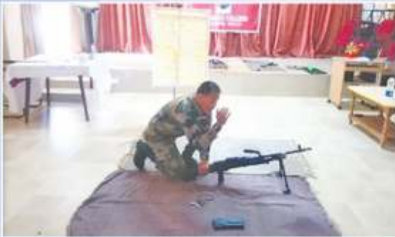
Weapons Training Programme