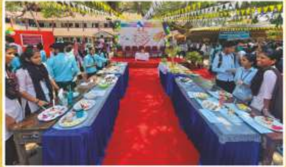
Food Fest-Carnival de Delicacy