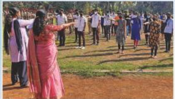
National Voters Day-Oath Taking