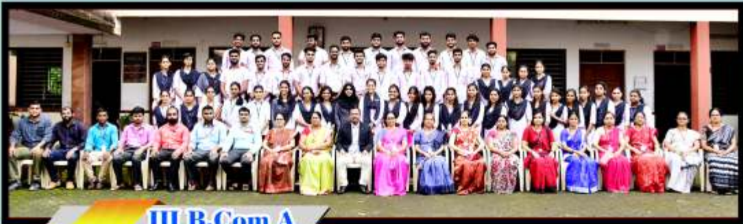
III B.Com A