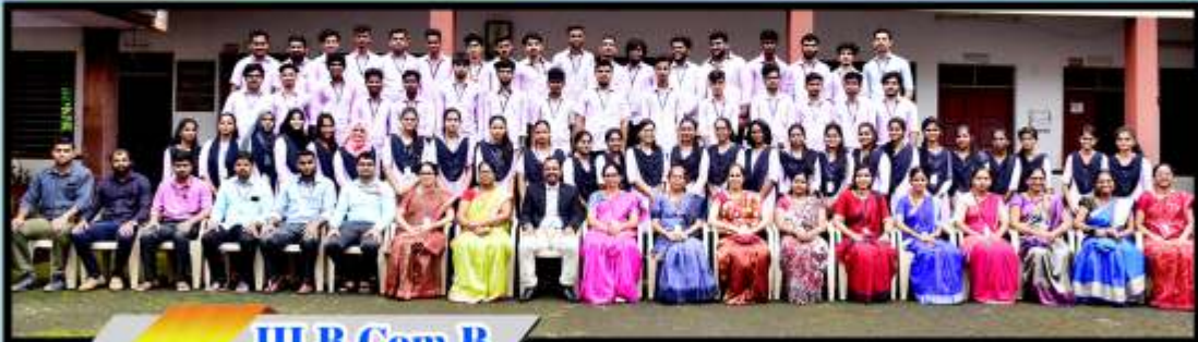
III B.Com B