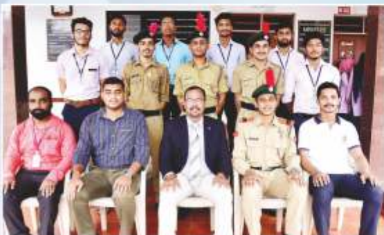
NCC C Certificate