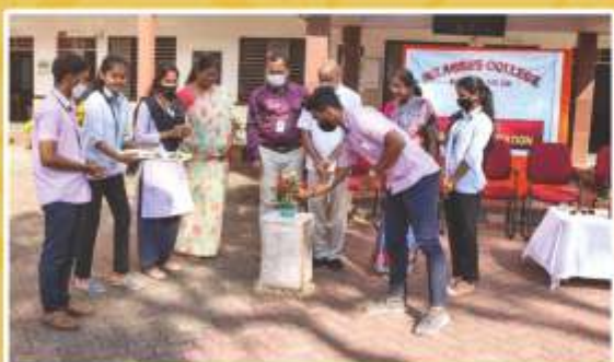
Inauguration of Commerce Association