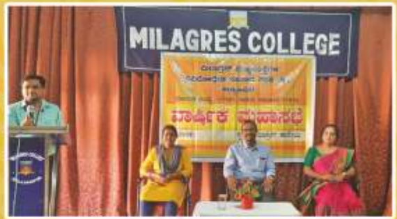
General Body Meeting -Cooperative Society