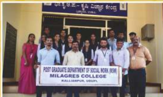
Visit to Krishi Vijnana Kendra