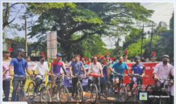
Fit India Freedom Run