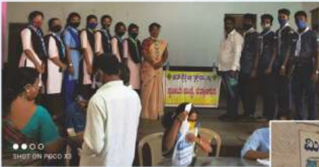
Service During SSLC Exam