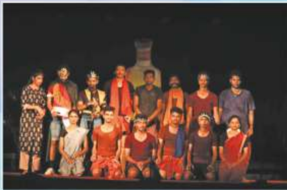
ADHWANAPURA DRAMA - Artists