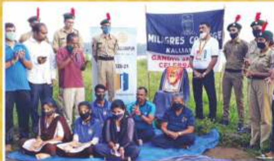
Gandhi Jayanthi Programme