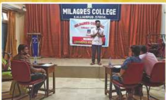
Stress Interview Competition