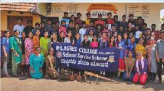
One Day Camp