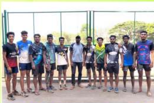
4 th place in Volleyball Tournament - MSRS College Shirva