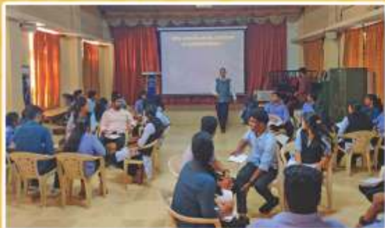
Workshop on Effective Communication