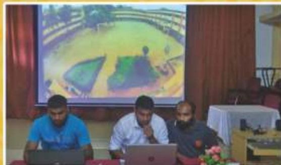
Online Session- Career Planning for better Job Opportunities