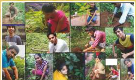
Plant a Sapling