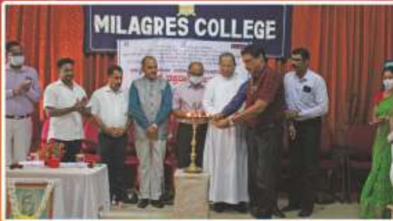
Inauguration - Blood Donation Camp