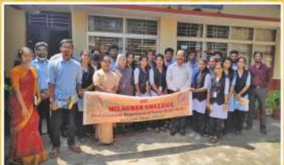
Orientation Visit-Canara Workshop