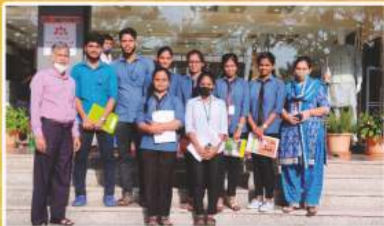
Field Visit-Sathanath Stores