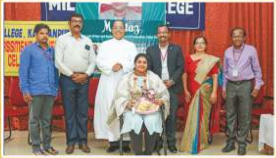
Mantaz Newly nominated District Judge honoured