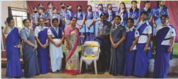
Gandhi Jayanthi Day