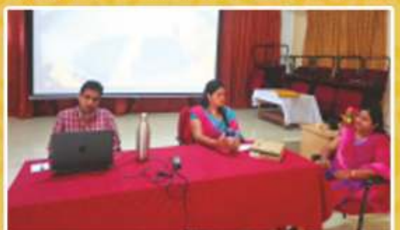
An Introduction to Literary Theories for Young Brains 7 Day Webinar