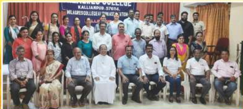
Office Bearers & Executive Committee Members