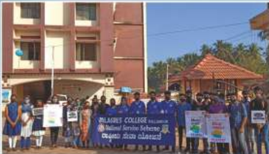
Mask Awareness Programme