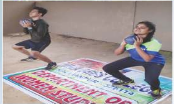
Fit India Run