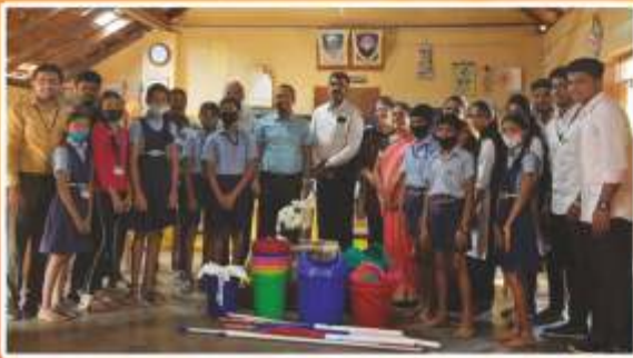
Donating Cleaning Kits to LVP School