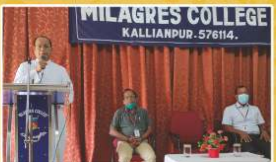
Programme on New Education Policy