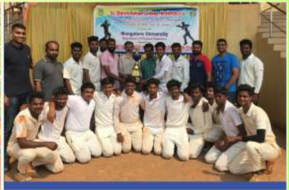
First Place Mangalore University Inter-Collegiate Udupi Zone Cricket