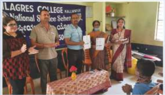
School Adoption Nejar School