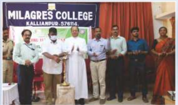
Clean - Green Village