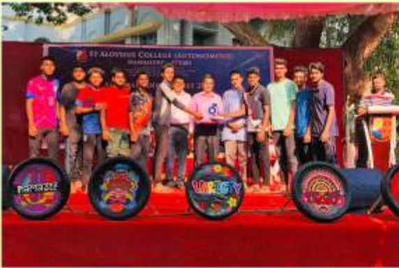
First Place in Aloysiad Cup Volleyball Inter-Collegiate Tournament