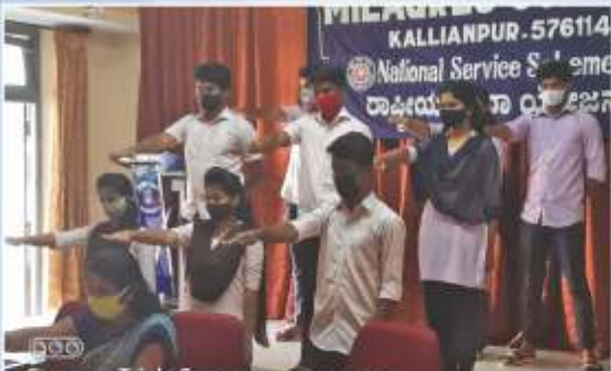
Covid Pledge-Oath Taking