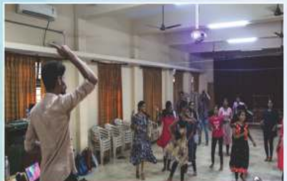
Inauguration of AAHAARYA, Workshop Series on various Art