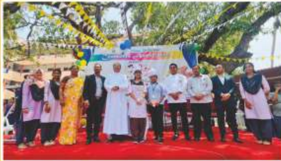
Inauguration of Food Fest