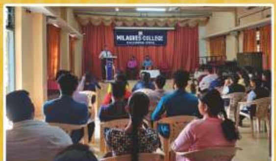
Self-Awareness for Personal Effectiveness