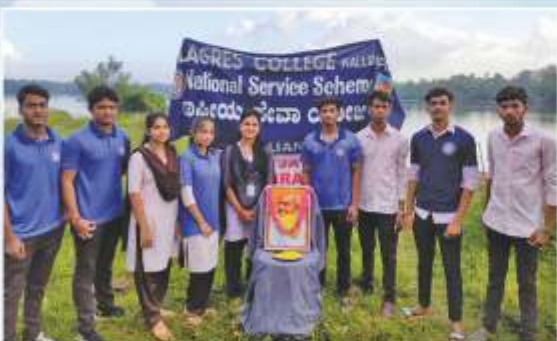
Gandhi Jayanthi Day